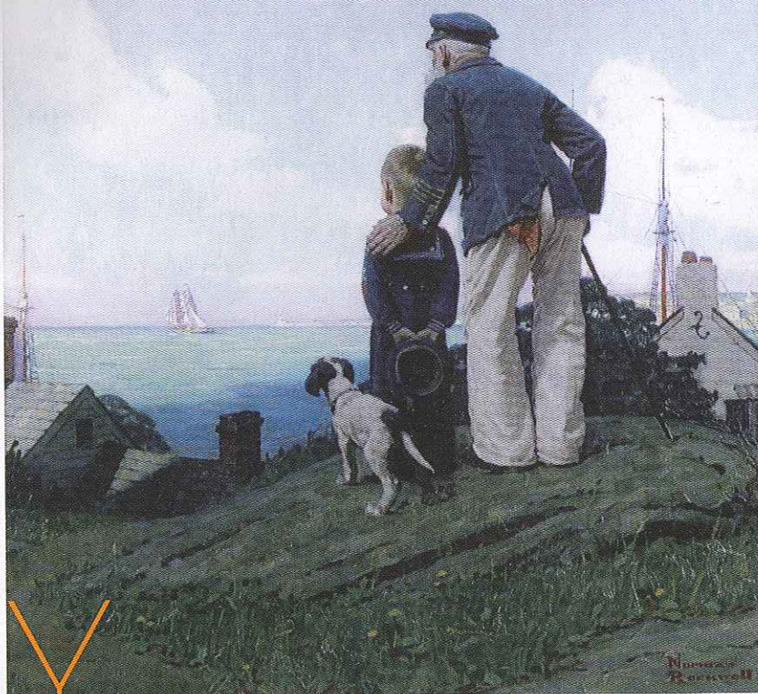
Norman Rockwell's Looking Out to Sea , from Norman Rockwell's Spirit of America (Abrams).

You knew it was only a matter of time before monstrously clever Colson Whitehead brazenly claimed another literary genre. This time, it's the post-apocalyptic horror novel. In Zone One (Random House), Whitehead envisions a post-plague-ravaged America split into the living and the living dead. Wait a minute... zombies? Are we sure this is fiction?